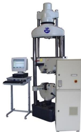
Modernisation MAN 600kN