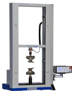
Modernisation Zwick 1435-5kN