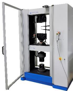
Modernisation UTM UTS-Eurotest250/300kN