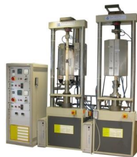
Modernisation Roell-Korthaus DSM 6102