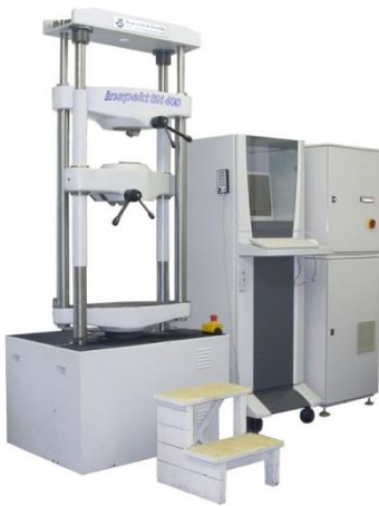
Modernisation EU40 40kN