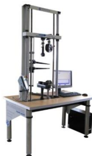
Modernisation UTS Type 010.20 10kN