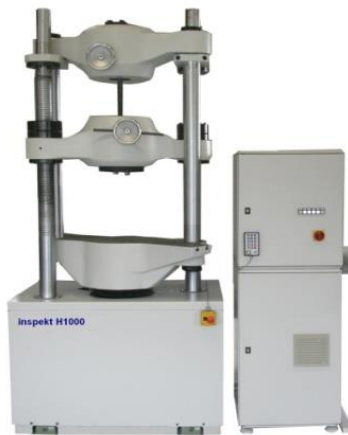
Modernisation Shimadzu 1000kN