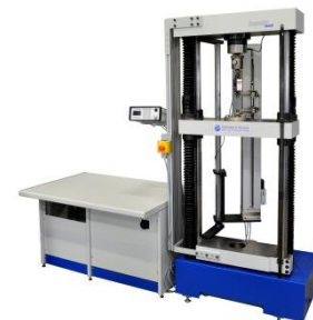
Modernisation UTM TIRAtest 24100 100kN