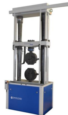
Modernisation Wolpert TZZ 250kN